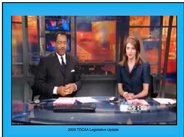
2009 TDCAA Legislative Update